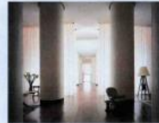
This time next year, THEhotel at Mandalay Bay will look a lot like Delano South Beach.