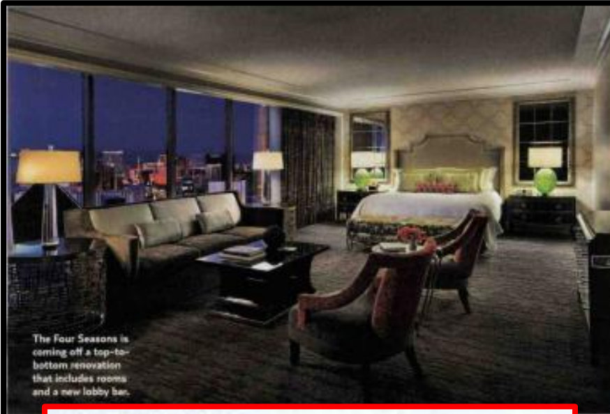
The Four Seasons is coming off a top-to-bottom renovation that includes rooms and a new lobby bar.